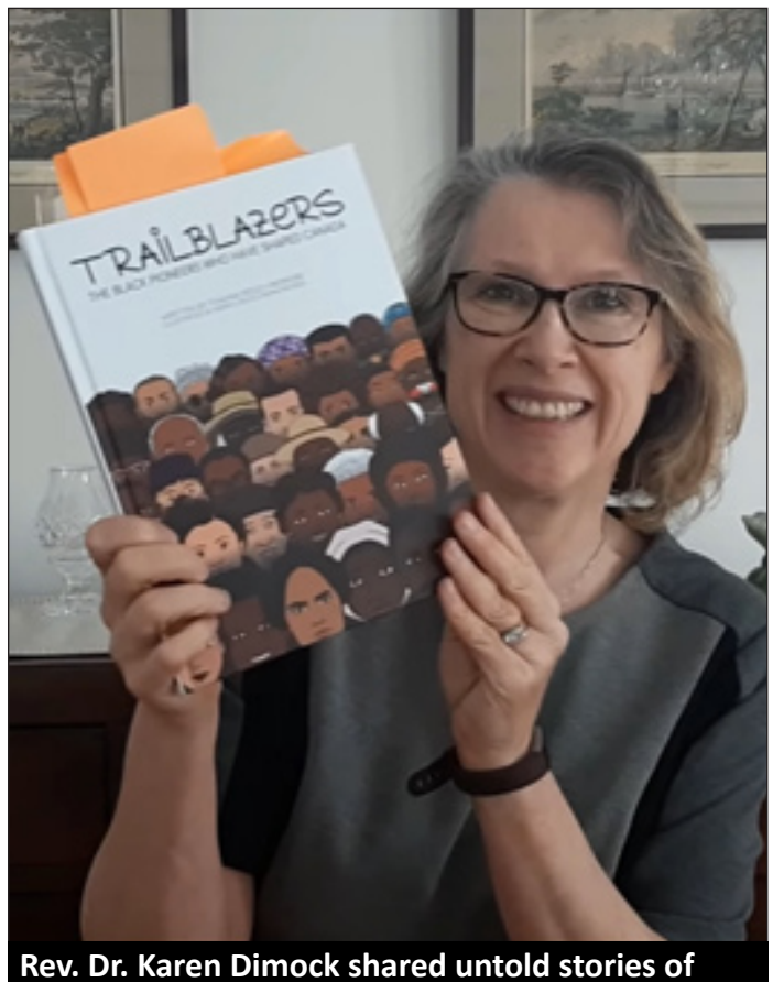
triumph and bravery for Black History Month.

Capital and Operating Budgets 2022 and Expenditures and Capital Funds 2021 are in a separate document.