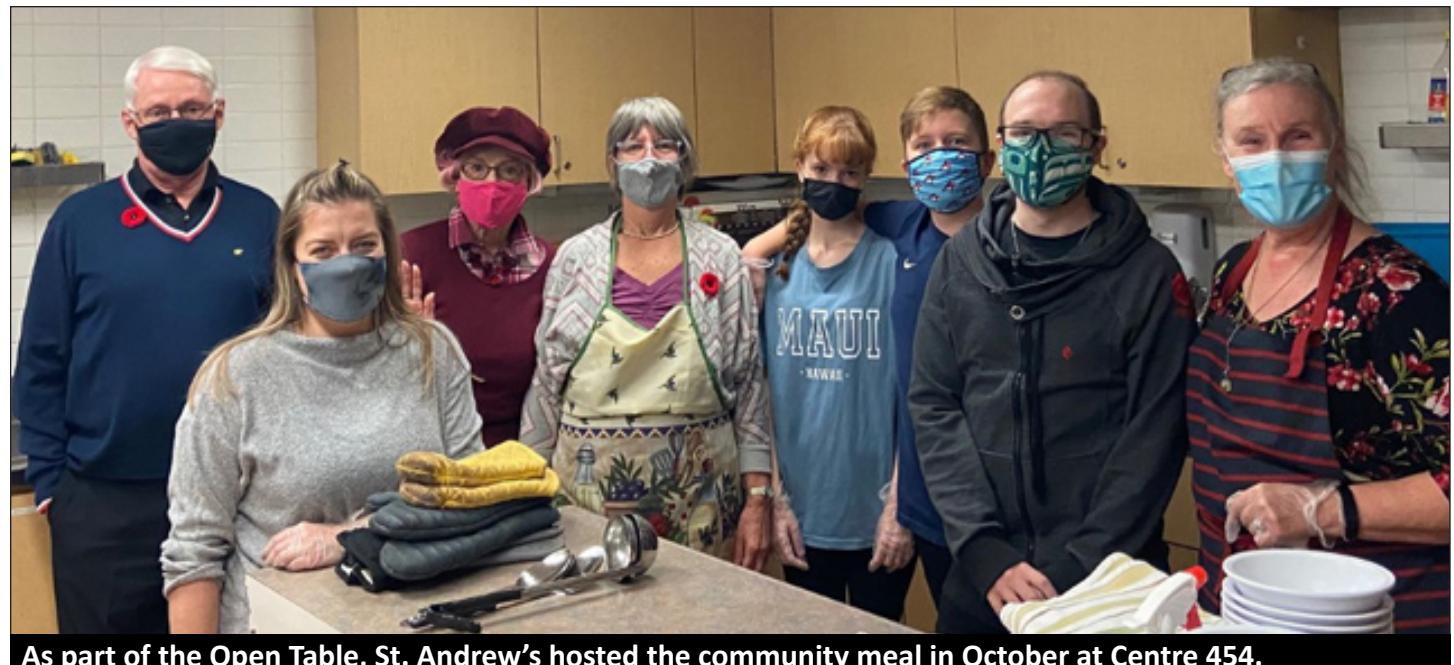
As part of the Open Table, St. Andrew's hosted the community meal in October at Centre 454.