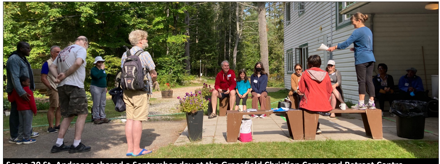
Some 30 St. Andreans shared a September day at the Gracefield Christian Camp and Retreat Centre.

The committees that work under the direction of the Kirk Session of St. Andrew's organize and implement the stewardship and discipleship initiatives of the church. Each committee has a different mandate, and the projects upon which they focus vary accordingly. On the following pages, you will find reports provided by the committees. These reports offer a summary of their work in 2021. You will also find lists of the committee members. If you would like to know more about a committee's work, please contact the committee's convener.