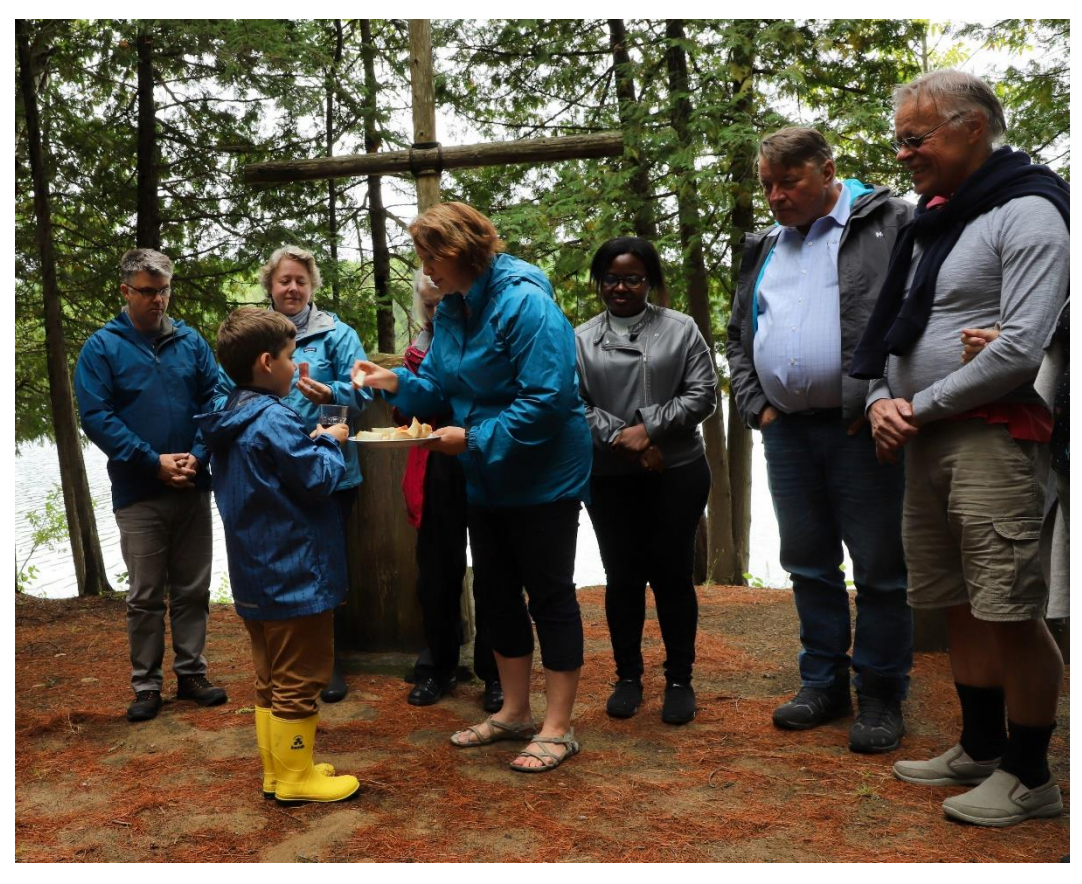
Gracefield Retreat.

There are many ways that you can make a difference in the lives of guests who come to Gracefield year-round. Every gift, large or small will help us to facilitate our many programs, as well as steward our amazing camp!