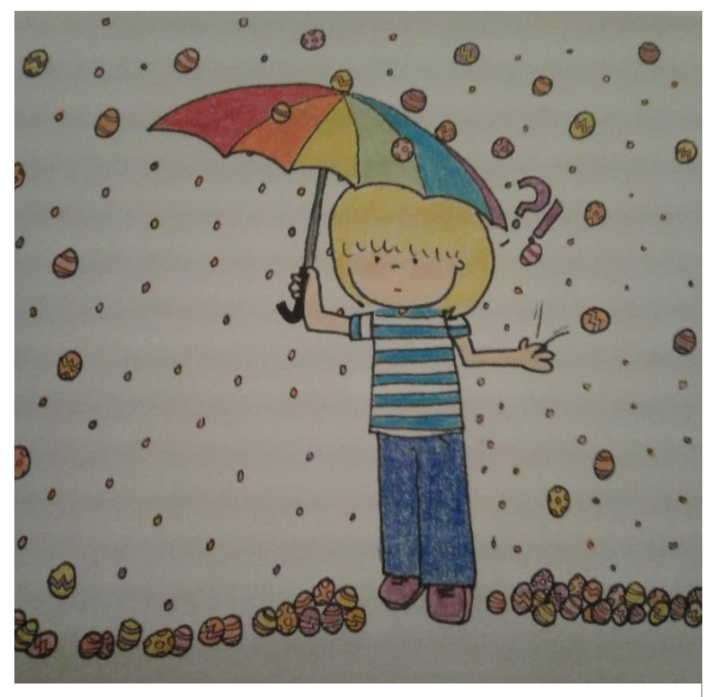
Raining Easter Eggs, by Lougheed