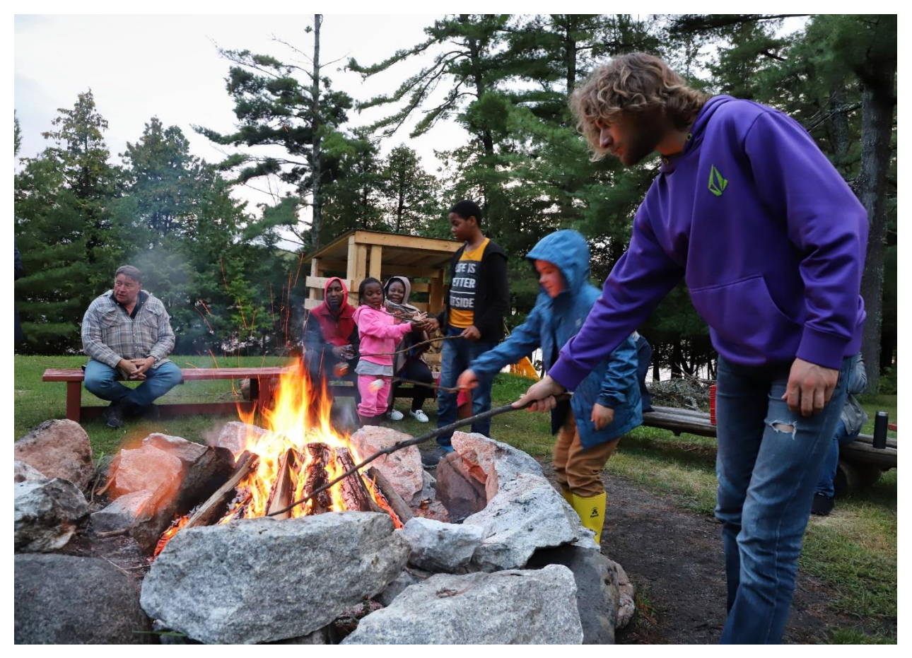
Gracefield Retreat.

Another way you can support us as a church is by sponsoring a cabin. We are currently looking for a church sponsor for Cabin 4. For more information on cabin sponsoring, please email secretary@gracefieldcamp.ca