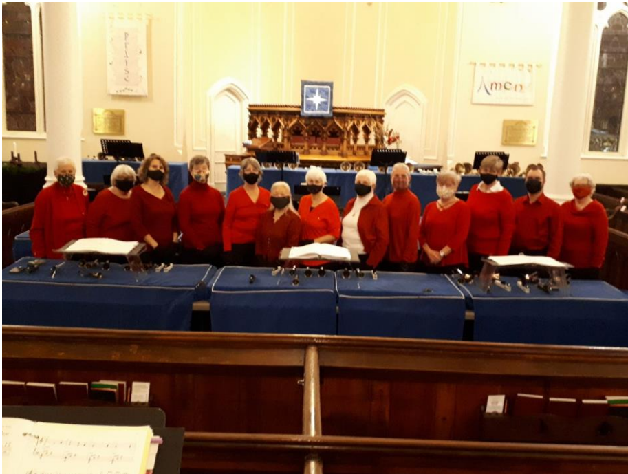
St. Andrew's Ringers, well-masked!