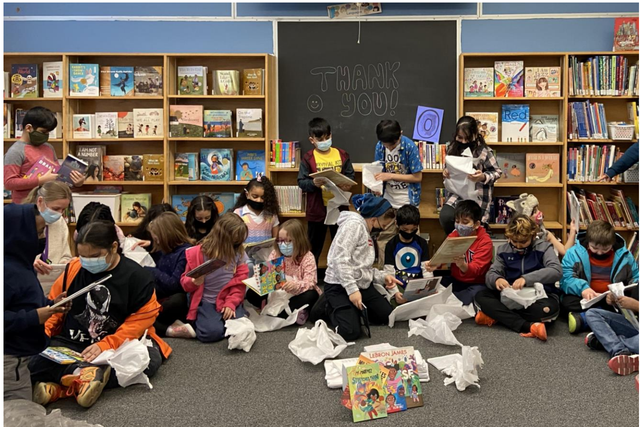
Kids at Queen Mary Street Public School, with their white gift books