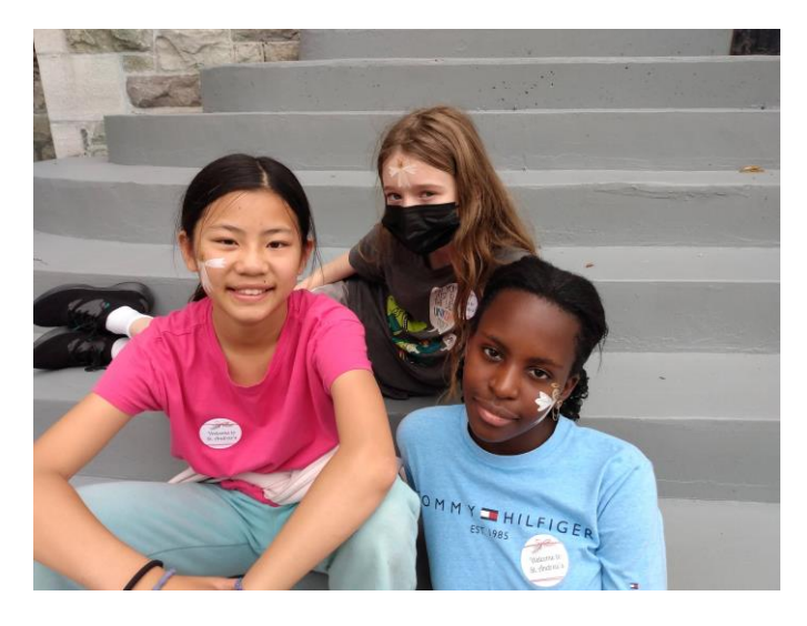
The Craft Leaders at Christmas in July