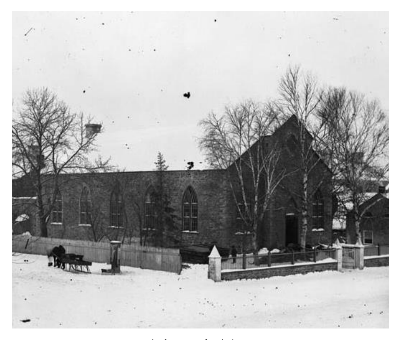
Spire-less St. Andrew's, in 1872

Such being the case, it became an interesting question, what was to be done with the money so raised for the benefit of this church by the members thereof."