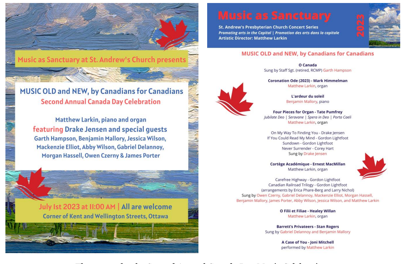
The poster for the Second Annual Canada Day Music Celebration